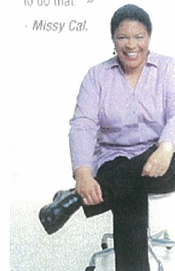
- Missy Cal.

©Copyright 2007 StopSmokingResolution.com. All rights reserved.