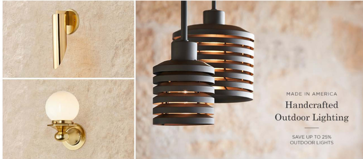
(Company website and emails).

C. Pottery Barn Teen and Pottery Barn Kids-branded upholstered furniture is made in America or in the USA