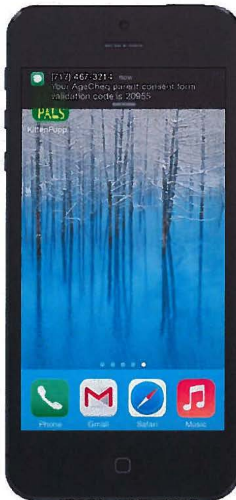
Figure 3- Parent's Mobile Device Receives Verification Code By Text Message